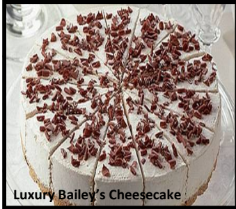
Luxury Bailey's Cheesecake