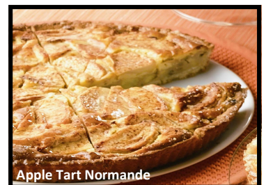
Apple Tart Normande

Sidoli Individual Dessert Slices - delicious products in convenient retail packaging.