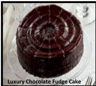
Luxury Chocolate Fudge Cake