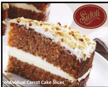
Individual Carrot Cake Slices

Sidoli Individual Dessert Slices - delicious products in convenient retail packaging.