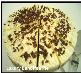
Luxury Banoffee Pie