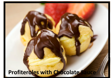
Profiteroles with Chocolate Sauce